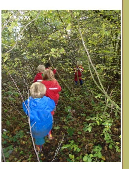
£25 per session

Wednesday 17th January—Winter in the Garden Wednesday 24th April—Spring into Summer 1.30pm - 3.30pm